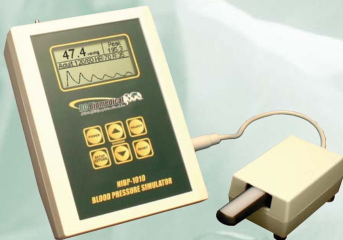
NIBP-1010 with MSP-2100 & FingerSim™

BC Group International, Inc. 9415 Gentry Avenue St. Louis, MO 63125 USA Phone: 314-638-3800 Toll Free: 1-888-223-6763 Fax: 314-638-3200 Email: sales@bcgroupintl.com Website: www.bcgroupintl.com